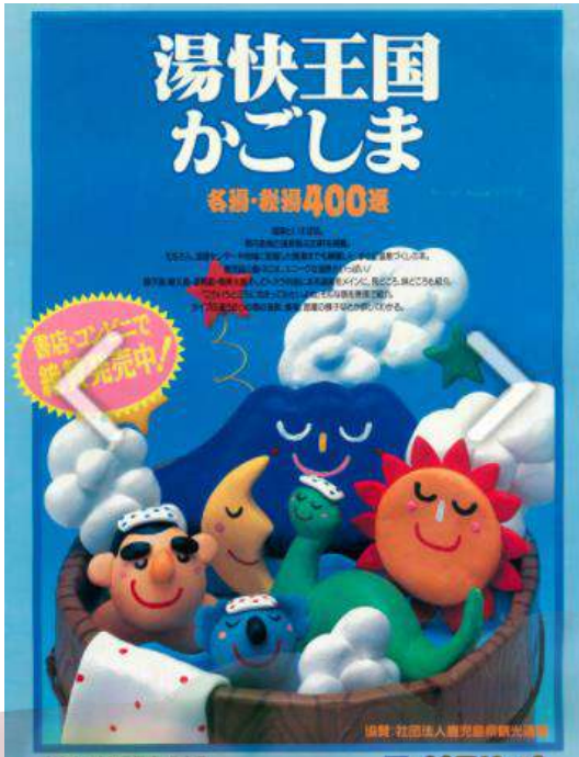
The cover of Onsen(hot springs) Magazine