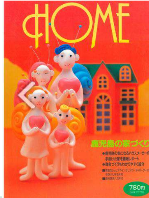
The cover of House Magazine, HOME